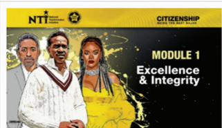
Citizenship – Module 1 Excellence & Integrity

Prerequisites – what you need to know before starting. You must finish these modules in order.