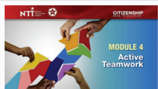
MODULE 4 Active Teamwork