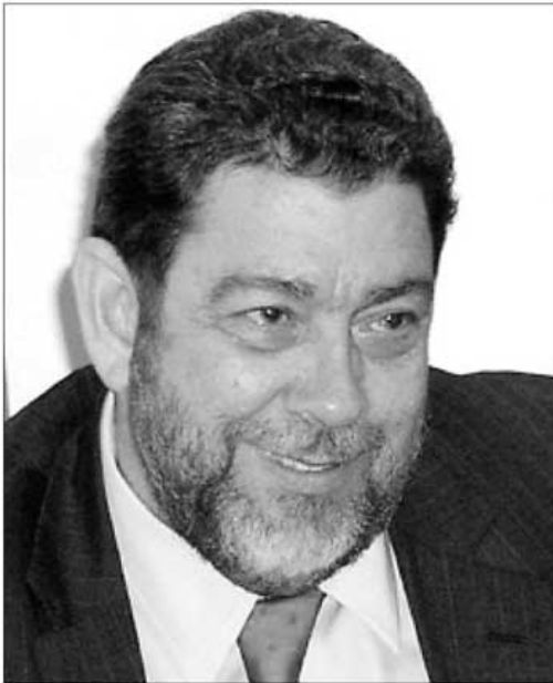
Prime Minister of St. Vincent and the Grenadines, Dr. Ralph Gonsalves,