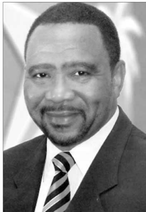
Leader of the People's National Congress Reform (PNC/R), Robert Corbin.