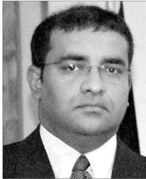
President of Guyana, Bharrat Jagdeo

ods and all types of shenanigans to obtain social services to which they are not entitled, increasing levels of crime, trafficking and exploitation of individuals for unlawful activities, increased opportunities for bribery and corruption of public officers, and the social antagonisms that can occur when some nationals feel threatened.