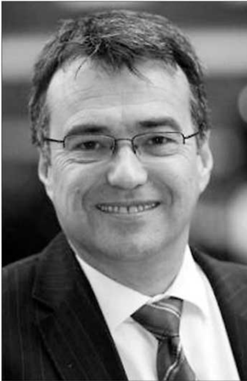
Former Immigration Minister of the United Kingdom, Phil Woolas.