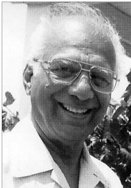
Dr. Cheddi Jagan, the Leader of the Opposition in British Guiana in 1965.

come the dumping ground for the unemployed, restless, and poverty-stricken in Barbados." With the granting of independence in 1966 to both Barbados and British Guiana, the latter being renamed Guyana, the proposed free trade pact with freedom of movement for nationals of the two countries was never implemented.