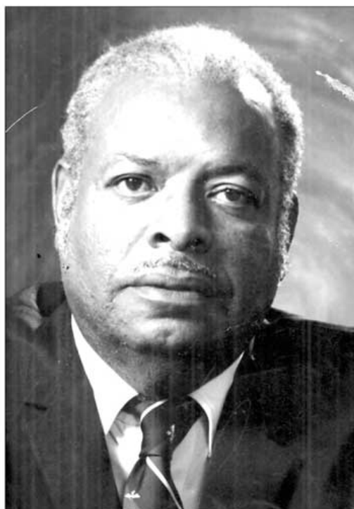
Premier of Barbados in 1965, Mr. Errol Walton Barrow.

CARICOM was established with the signing of the Treaty of Chaguaramas on 4th July